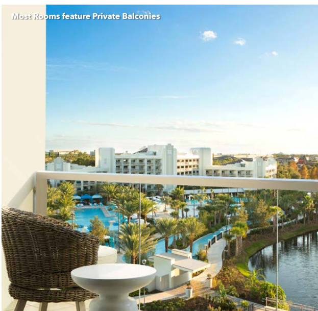
Most Rooms feature Private Balconies