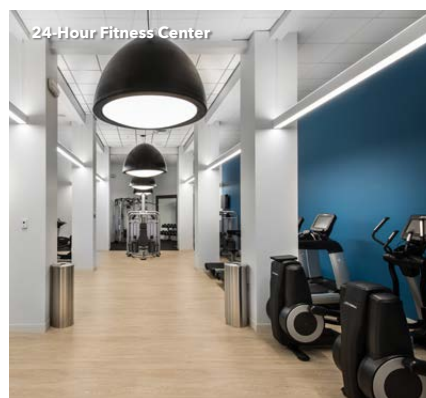
24-Hour Fitness Center