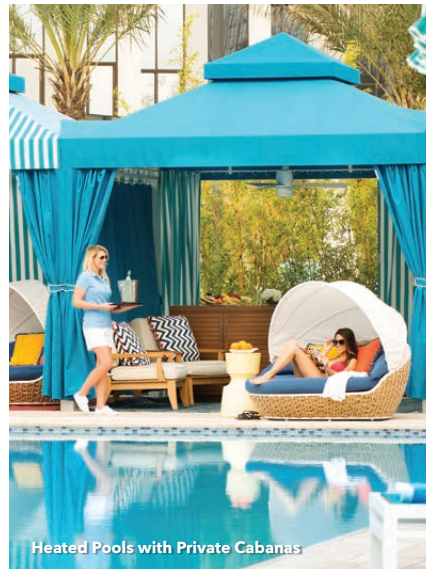
Heated Pools with Private Cabanas